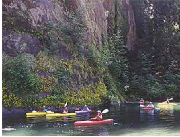
Boaters on the Eel River